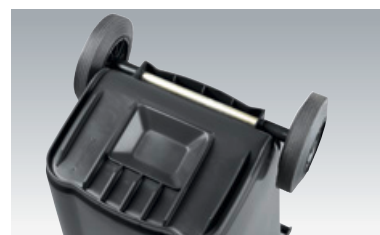
GMT eXtra 120 S und 240 S with reinforced base