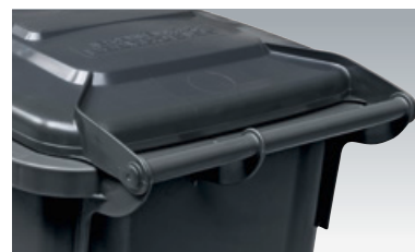
Lid with 2 point hinges