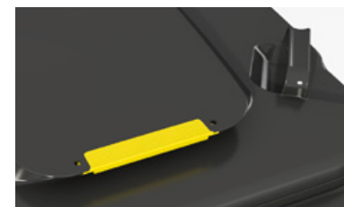
Lid type Ergolid with clip